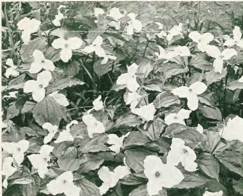
Trillium grandiflorum. See page 9

Including Trilliums, Lilioms, Iris, Dicentra, Galax, Phlox, Sedum, Shortia, Cyripediums, and Many Others